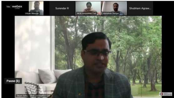
Orientation Session on IIC5.0 (2022-23) & Features - MoE's Innovation Cell 36,511 views... 1.1K DISLIKE SHARE DOWNLOAD CLIP SAVE ...